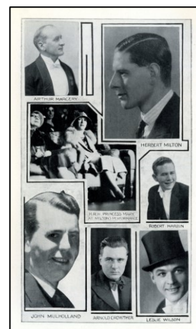
Page as printed.

We have some printed proofs of the illustration pages (below). These make it clear that the halftone images were printed in one operation, and the names of the magicians and outline decorations in a second operation.