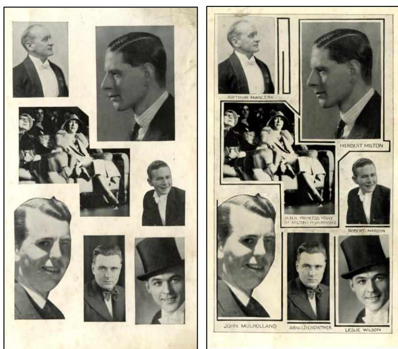
Left: proof taken off the halftone blocks. Right: the page as finished once the names and decorations have been added.