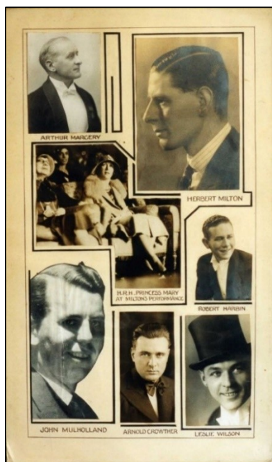
Original artwork 300 x 510mm.