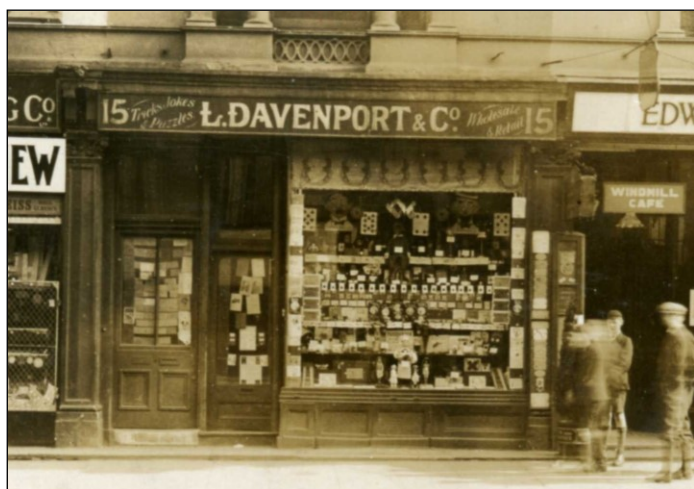
15 New Oxford Street